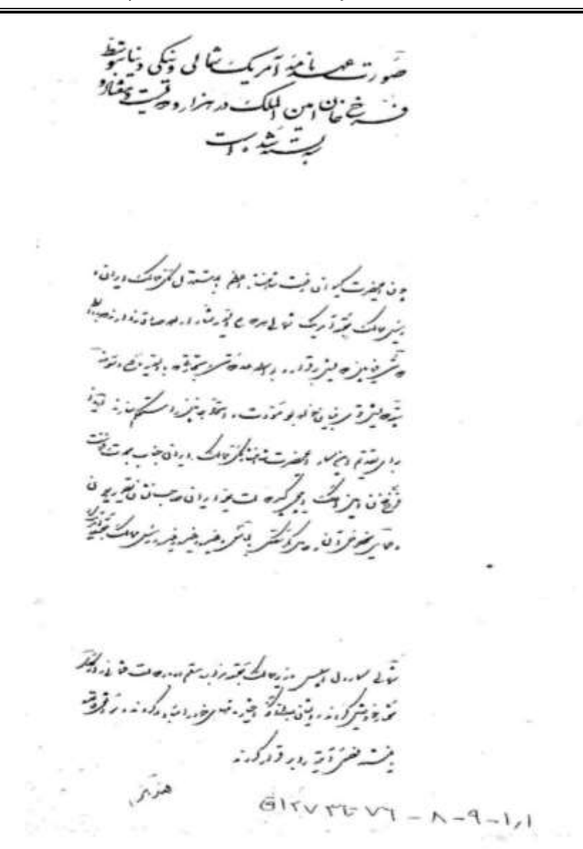
The Text of Treaty of Iran and the United States in 1857 (Center for Documentation and Diplomatic History of the Foreign Ministry of Iran)